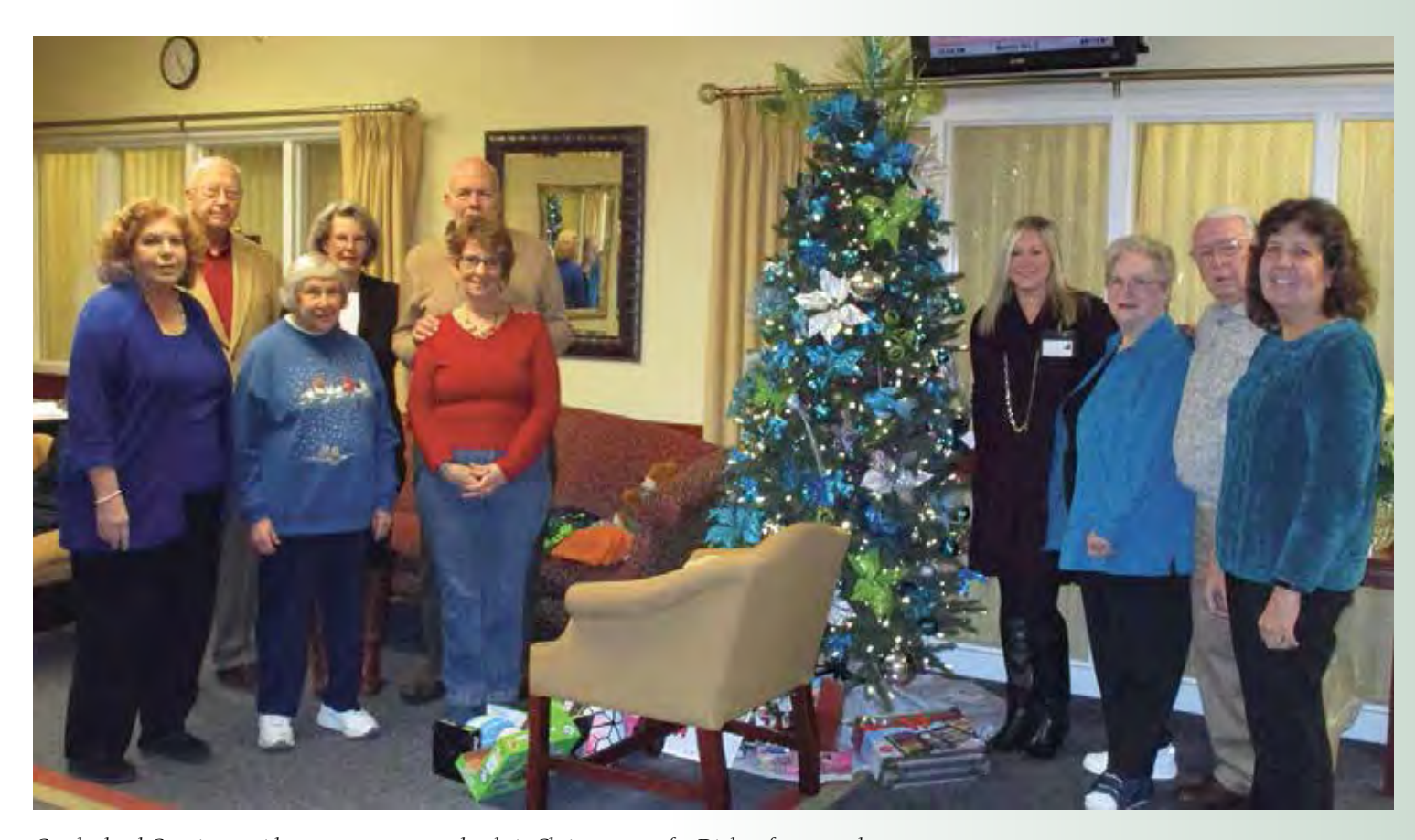
Cumberland Crossings residents put presents under their Christmas tree for Diakon foster youths.