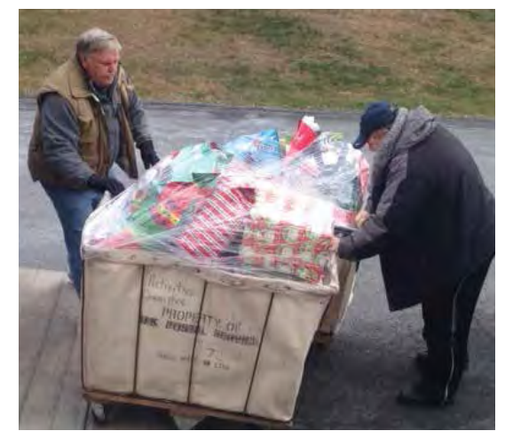
Air Products staff delivers a load of Christmas presents – no reindeer needed!

very year, Air Products and Chemicals, Inc., of Allentown, Pennsylvania, contacts Diakon Adoption & Foster Care and requests names (first names only) of children in foster care. The company's generous staff members buy gifts for each child, then wrap and deliver the gifts to the Topton location. Diakon Adoption & Foster Care staff make the deliveries to the foster children.